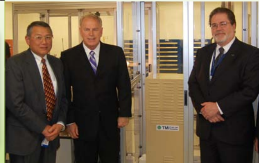
Ohio Governor Ted Strickland at first-in-the-world public demonstration fueled by untreated military JP8.

As one Lockheed Martin executive said; "We believe the high fuel efficiency of TMI's fuel cell system and its ability to operate directly on untreated military logistic fuel will solve some of the most urgent and important power generation problems faced by the United States Department of Defense (DoD), Lockheed Martin's major customer."