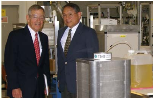
U.S. Senator George Voinovich views first-in-the-world soybean oil demonstration.

This groundbreaking demonstration built upon another first established in 2007 when, through the support of checkoff funds from Ohio soybean farmers and research funding from the USDA, TMI became the first fuel cell company in the world to convert raw vegetable oil into electricity.